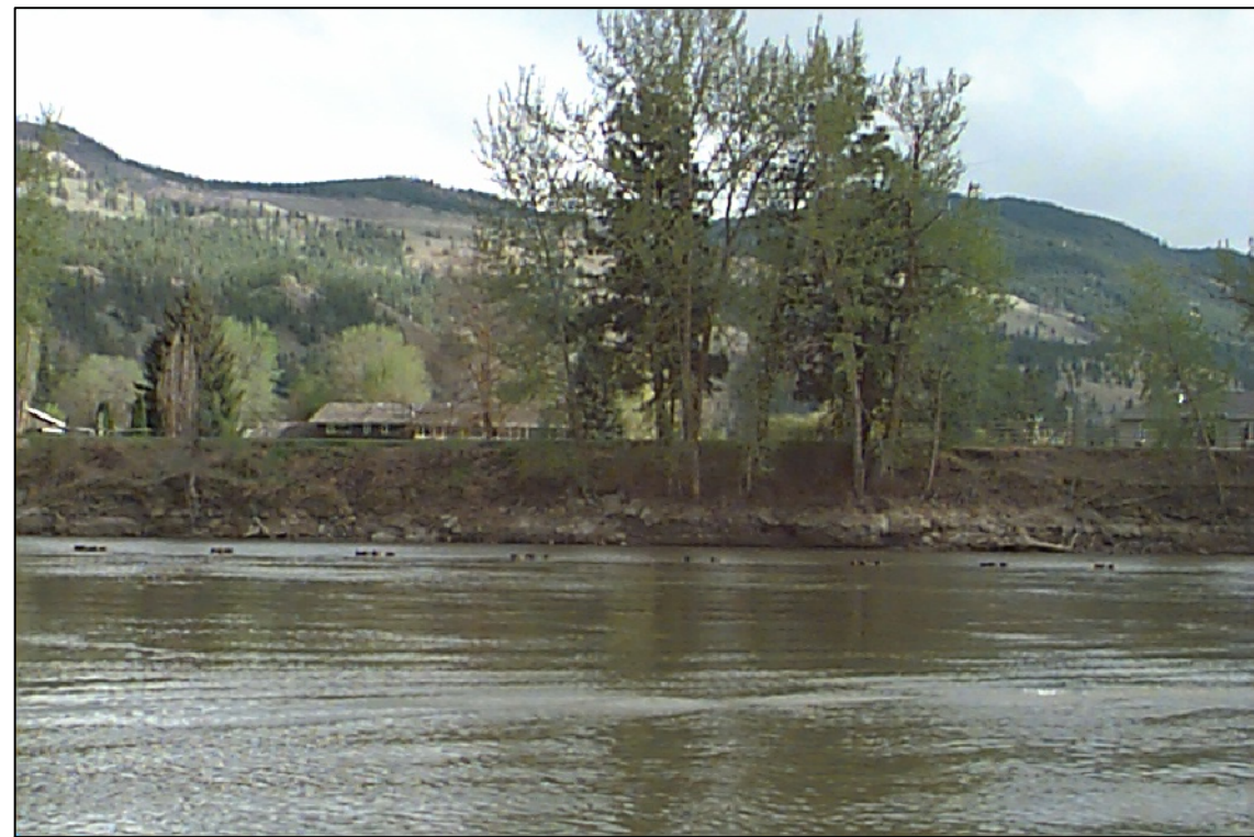
LEFT BANK VIEW