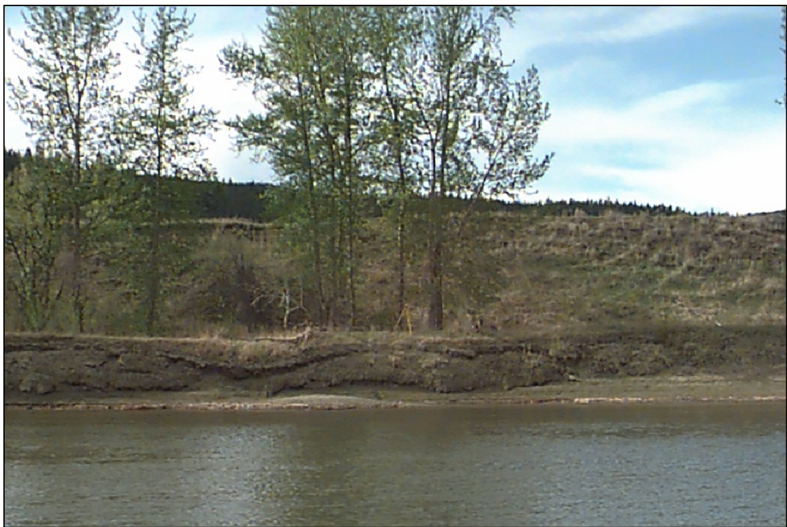
RIGHT BANK VIEW